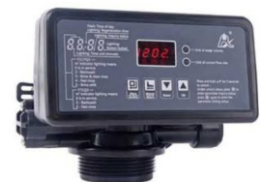
Automatic Multiport Valve